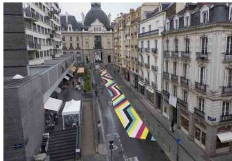
Lang/Baumann, Street Painting #7 , 2013, road paint, 59 x 3,7 m. Produced by 40mcube and PHAKT, with the corporate sponsorship of Signature and Identic, and with the support of the city of Rennes and of Pro Helvetia, Swiss Foundation for Culture.