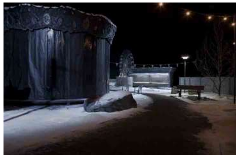
Hans Op de Beeck, The Amusement Park , 2015, sculptural installation, mixed media, sound, 5,2m (high) x 16m (wide) x 24m (depth). Produced by Les Champs Libres. Curated by 40mcube. Courtesy Galleria Continua. Photo: DR.