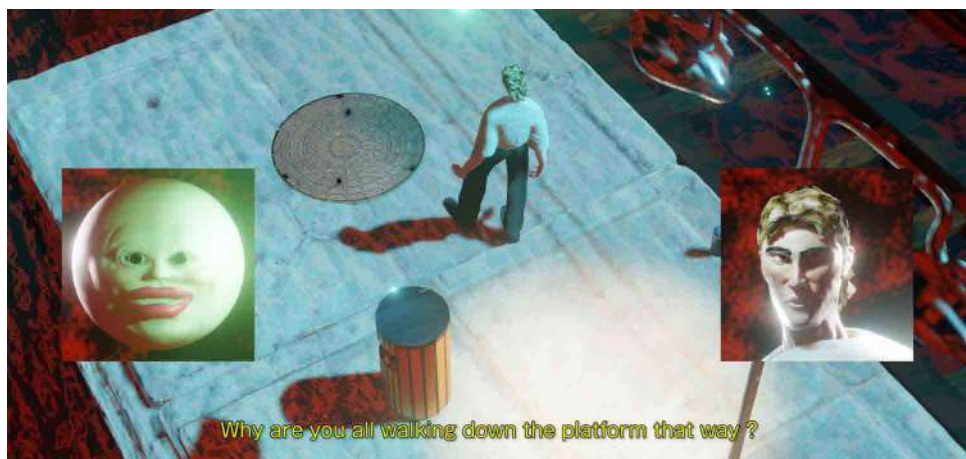
Stanislas Paruzel (with Baptiste Le Chapelain-Trivier), Perdu !! , 2023, HD video, 24'09".