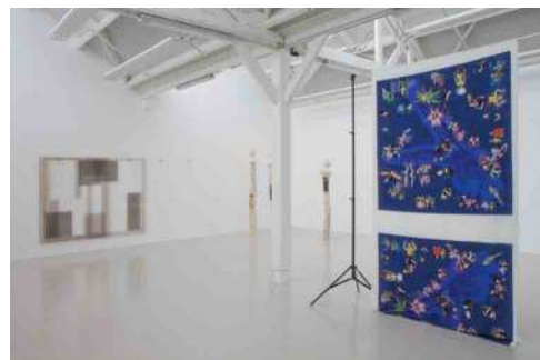
(Left) Éléonore False, Sourire éternel #2 , 2019. Produced by 40mcube - Cnap and Éléonore False. (Background, centre) Hélène Bertin, Fête , 2019. Produced by 40mcube - Cnap. (Right) Ingrid Luche, NassimeSabz (Foulard) , 2019. Produced by 40mcube - Cnap. Courtesy Air de Paris. View of the exhibition Bertfalhe - 40mcube, 2019, presented as part of the Suite program initiated by the Cnap, in partnership with the ADAGP.