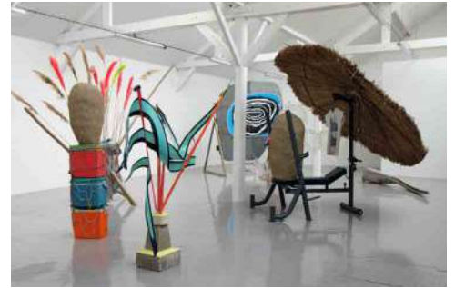
Yann Gerstberger, Stranger by Green , 2011, exhibition view. Curated and produced by 40mcube.