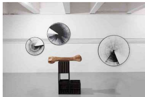
Claudia Comte, Sonic Geometry , 2015. Produced by 40mcube / Art & Essai gallery, with the support of Pro Helvetia - Swiss Foundation for Culture. Curated by 40mcube.