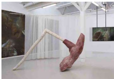
Laura Gozlan, Onanism Sorcery , 2021, exhibition view. Curated and produced by 40mcube.