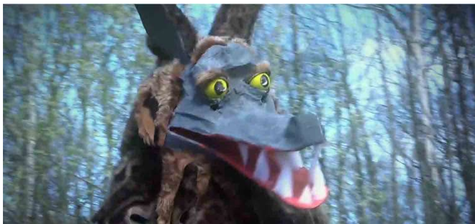
Stanislas Paruzel, Le Village du Bout du Monde , 2023, HD video, 16'31". Produced by 40mcube, with the support of Courtel Company and IME Les enfants au Pays.