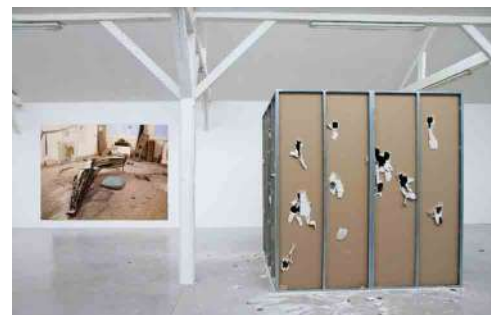
(Left) Emmanuelle Lainé, Effet Cocktail , 2011, numeric file and lambda print, variable dimensions. Inv. FNAC AP12-1 (15). © Emmanuelle Lainé / CNAP. (Right) Steven Parrino, Trashed Black Box n°2 , 2003, 250 x 240 x 240 cm. © D.R. / CNAP.