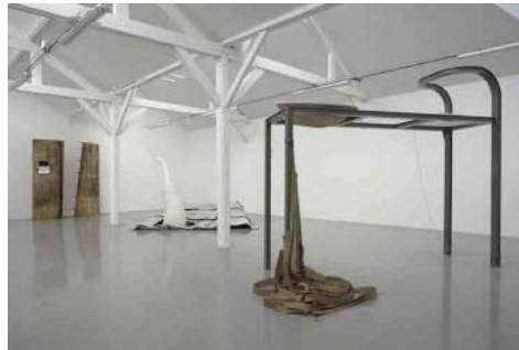
Emmanuelle Lainé, INGENIUM , 2010. Curated and produced by 40mcube. With the support of Art Norac, as part of the Ateliers de Rennes - Contemporary art biennale.