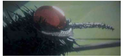
Stanislas Paruzel, Marc juché dans le grand pin (chap XV), 2022, UHD video, 18'48". Produced by GENERATOR - 40mcube / Self Signal.