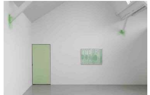
Loïc Raguènes, Avec une bonne prise de conscience des divers segments du corps, votre geste sera plus précis dans l'eau , 2013. Curated and produced by 40mcube.