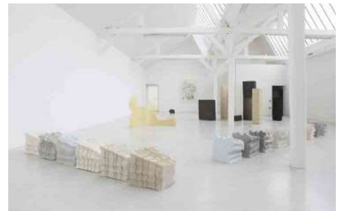
Marion Verboom, Agger , 2012. With the support of Art Norac, as part of the Ateliers de Rennes - Contemporary art biennale. Courtesy galerie Anne de Villepoix. Photo: Aurélien Mole.